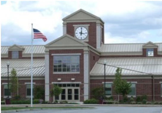
Trotwood-Madison High School