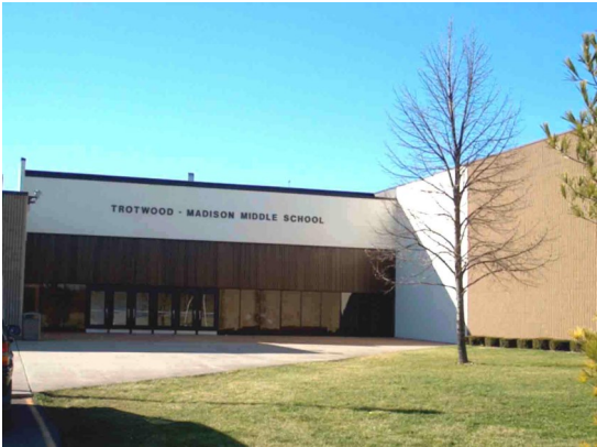
Trotwood-Madison Middle School