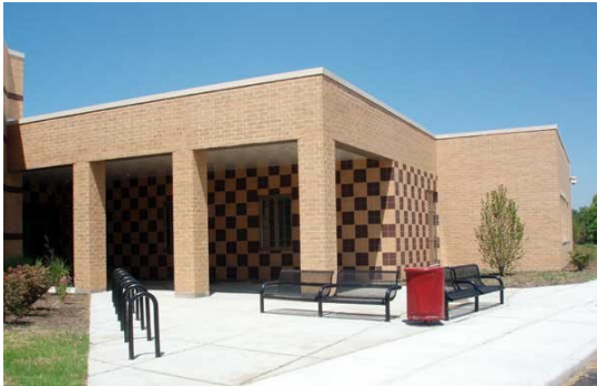
Madison Park Elementary School